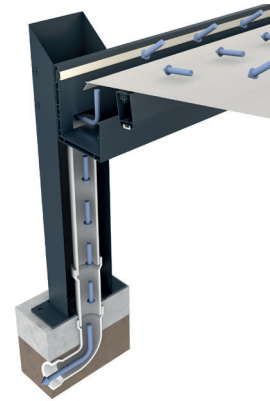
Fulvia with slab channel drainage.