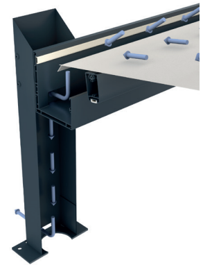
Fulvia with free-flow drainage.